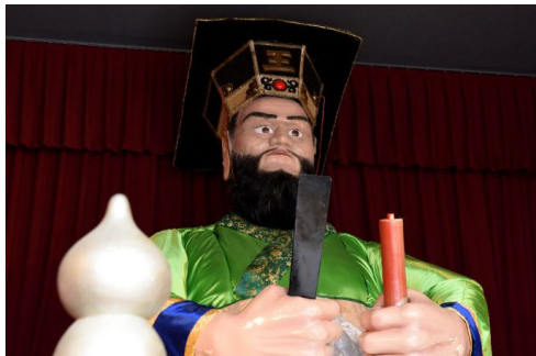
Enma shrine (閻魔堂) ※performance at 11:00