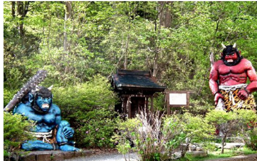
Prayer demon shrine (念仏鬼祠)