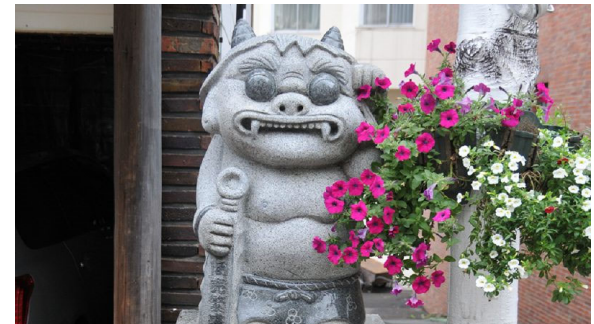
Prosperity demon (繁盛の鬼)