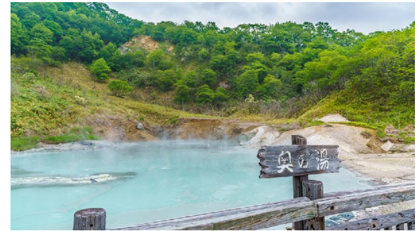
Oku-no-yu(奥の湯, Pond over crater)