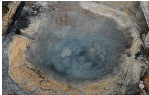
Tessen-ike(鉄泉池, Hot spring)